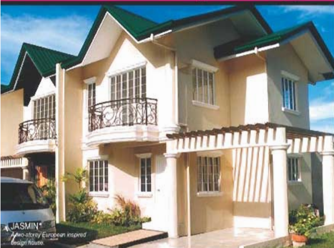
JASMIN* A two-story European inspired design house.

Build your dream home on Residential Lots ranging from 40 to 212 sq. mtrs. Or enjoy the comforts of living in any of the three well-designed House and Lot Packages at flexible payment terms.